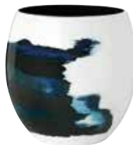
The large vase

Size: Ø 166 mm, H 220 mm Art. no.: 450-21