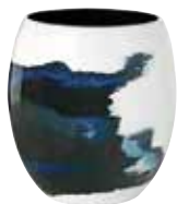
The medium vase

Size: Ø 131 mm, H 178 mm Art. no.: 450-20