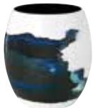
The small vase

Size: Ø 131 mm, H 178 mm Art. no.: 450-20