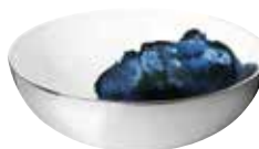
The medium bowl

Diameter: Ø 200 mm, H 70 mm Art. no.: 450-11