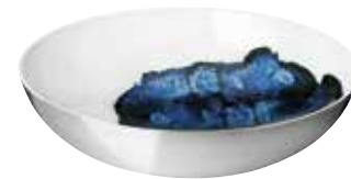
The large bowl

Diameter: Ø 300 mm, H 100 mm Art. no.: 450-12